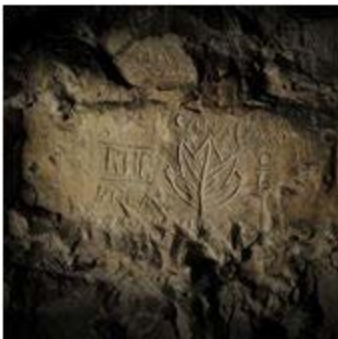
Photograph of a carving in Blenheim Quarry, Arras, France

An exhibition developed by the Canadian War Museum in partnership with the Fort Erie Historical Museum.