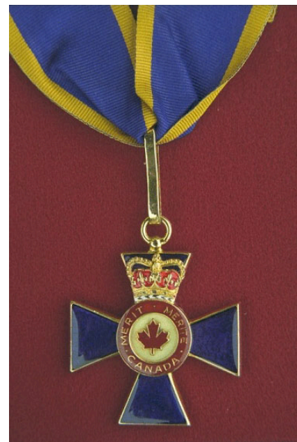
The CMM medal.

More information about the Honours and Awards and the Campaign or general service medals can be found on the web site) of VAC. ( www.vac.gc.ca ). There is also an excellent booklet produced by DND entitled Canadian Honours and Awards . This